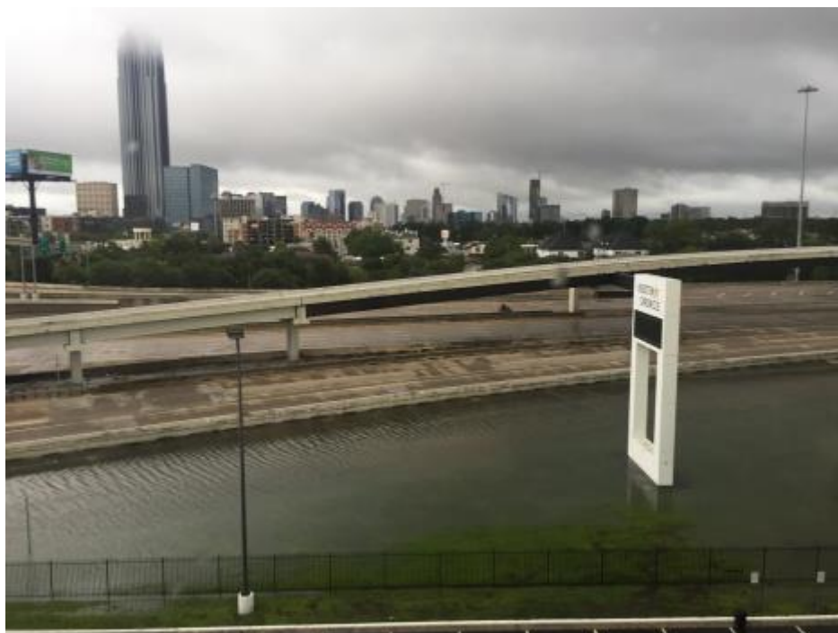
The frontage road surrounding the Houston Chronicle on three sides, submerged in water due to Hurricane Harvey, August 28, 2017.

Ilene: Do you believe the severity of recent hurricanes (Harvey in Houston and Irma in Florida) is a symptom of climate change and a preview of what to expect in the future?