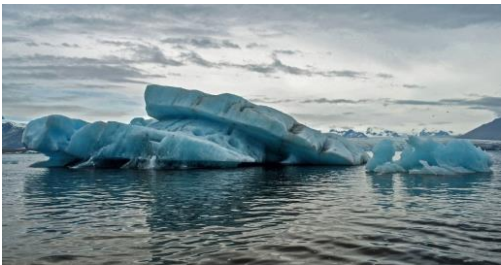
Arctic Ice

The good news is that most people do want action on climate change. Prudent risk management on climate would say that action is warranted. People who believe climate change is not a problem might ask themselves “what will I tell my grandchildren if I’m wrong?”