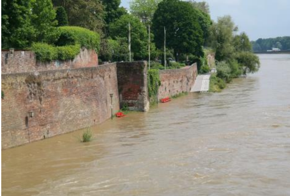
Excessive rainfall led to the river Danube (Europe's second longest river) flooding and causing extensive damage in Ulm, Germany, June 2013.

The real question is what legacy are we choosing to leave our grandchildren – will they have a decent way of life or will they have to deal with massive climate problems? We actually do not have a choice about finding climate solutions if we want to leave a livable world to our descendants. We should think in a risk-management framework.