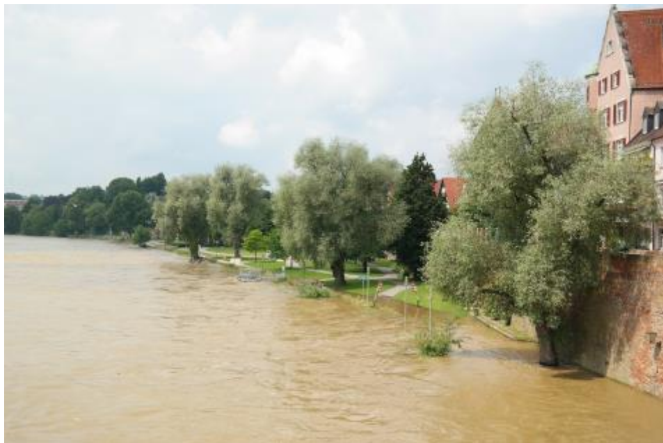
Flood damage by the river Donau (Danube) in Ulm, Germany, in 2013.

are tied to the fossil fuel sector, as well as others vulnerable to climate change, who will require assistance to survive.